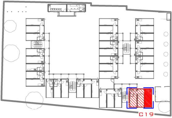
C19 TYPE 3 HANDED (DWELLING 31)